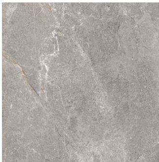
ES. Este producto tiene 3 caras. EN. This product has 3 faces.